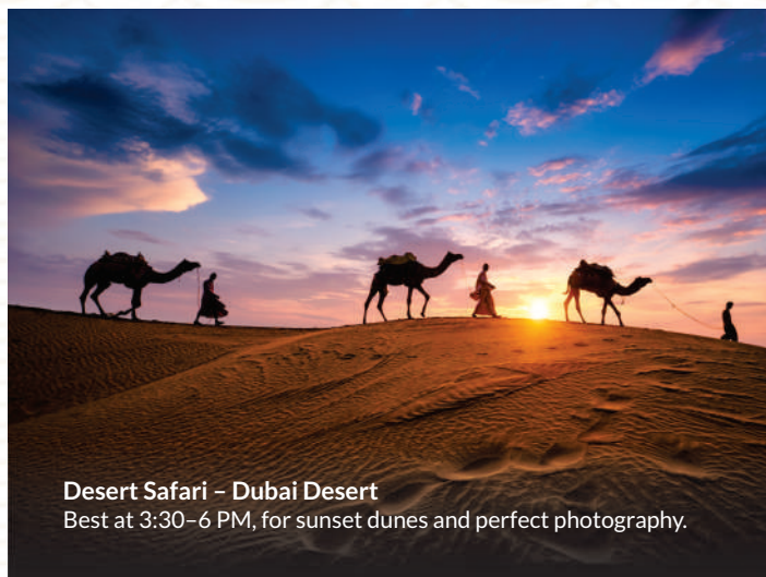
Desert Safari – Dubai Desert

Best at 8–10 AM for leisurely exploration without the crowds.