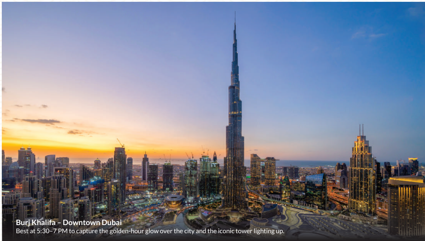
Burj Khalifa – Downtown Dubai

Best at 5:30–7 PM to capture the golden-hour glow over the city and the iconic tower lighting up.