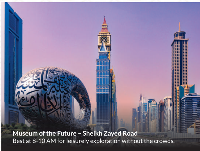
Museum of the Future – Sheikh Zayed Road

Best at 7–10 PM when the skyscrapers light up.