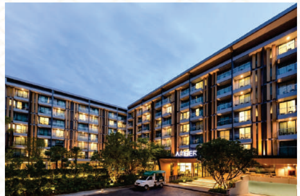
Mid-Range Recommendation Hotel Amber Pattaya