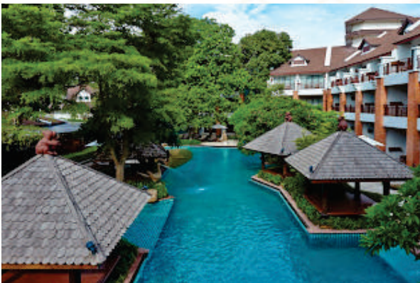
Luxury Recommendation Woodlands Hotel & Resort Pattaya