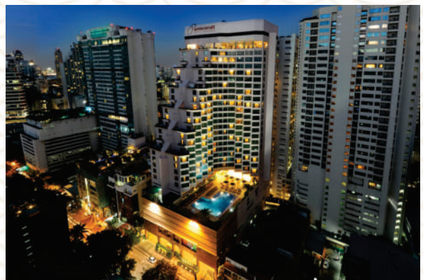
Mid-Range Recommendation Rembrandt Hotel, Bangkok