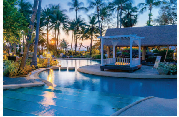
Mid-Range Recommendation The Thavorn Palm Beach Resort