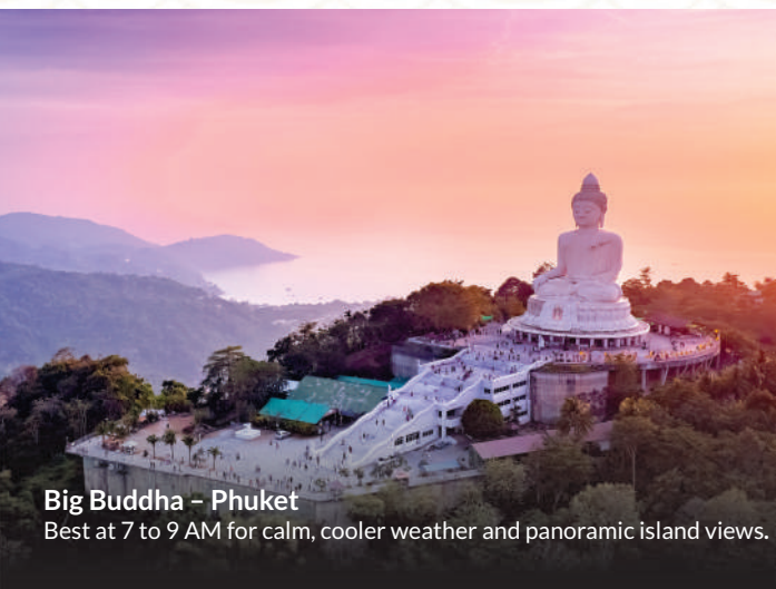
Big Buddha – Phuket

Best at 10 AM to 12 PM for wooden carvings in sunlight.