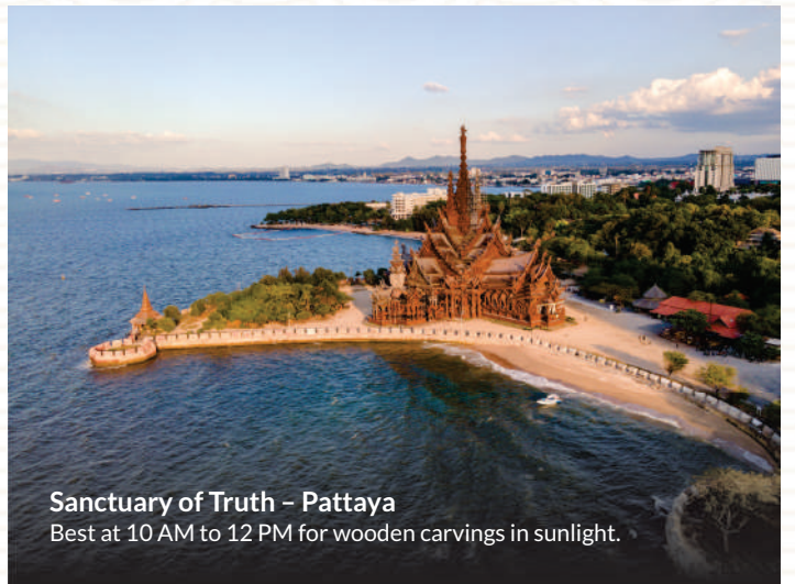
Sanctuary of Truth – Pattaya

Best at 5 to 6 PM for sunset reflections on the riverside spires.