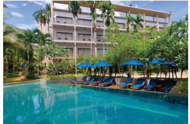
Mid-Range Recommendation Deevana Plaza Krabi Aonang