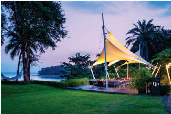
Luxury Recommendation The ShellSea Krabi