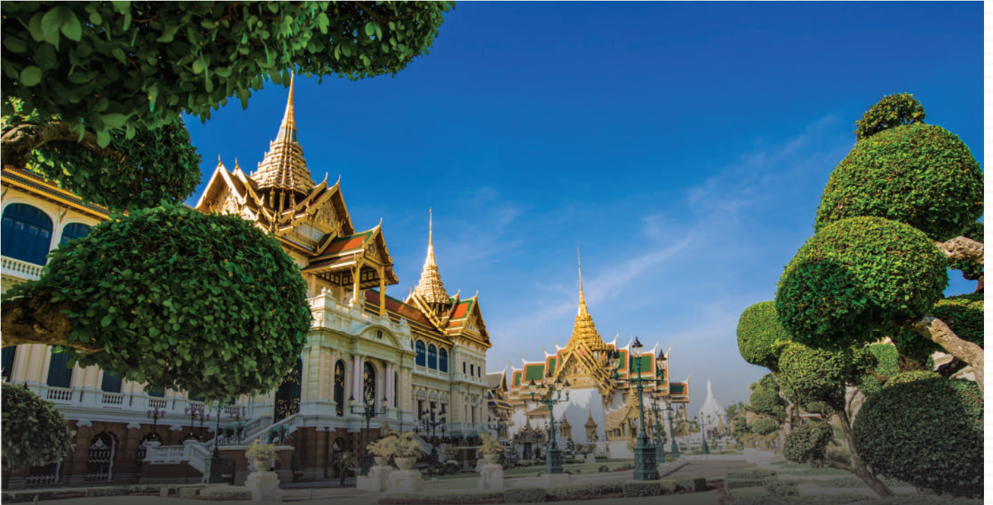
Grand Palace – Bangkok

Best at 8 to 10 AM for soft morning light and fewer crowds at the glittering temples.