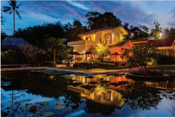
Luxury Recommendation Vijitt Resort Phuket