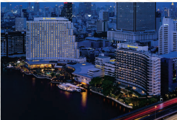
Luxury Recommendation Shangri-La Hotel, Bangkok