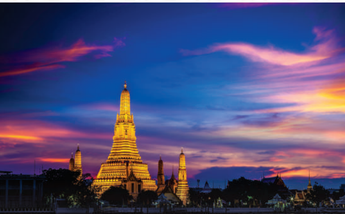
Wat Arun – Bangkok

Best at 8 to 10 AM for soft morning light and fewer crowds at the glittering temples.