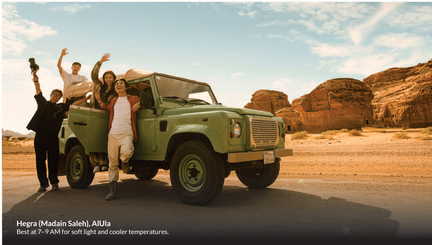
Hegra (Mada'in Saleh), AlUla

Best at 7–9 AM for soft light and cooler temperatures.