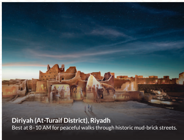
Diriyah (At-Turaif District), Riyadh

Best at 4–6 PM to see the mirrored façade reflect the desert at sunset.