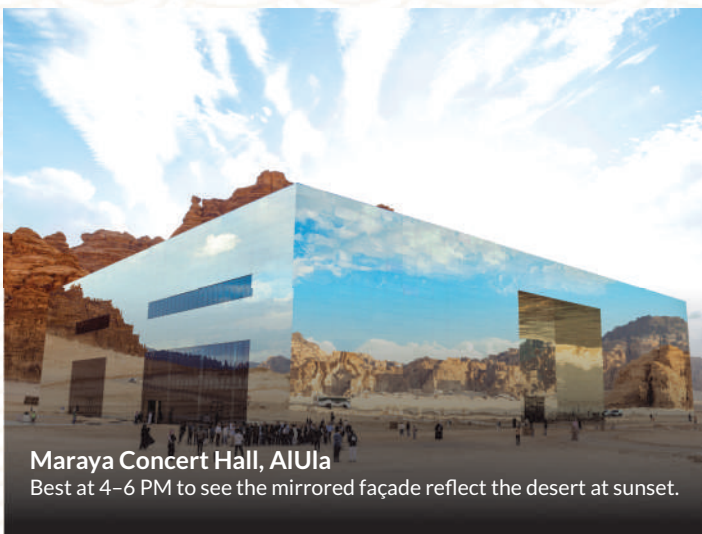
Maraya Concert Hall, AlUla

Best at 7–9 AM for soft light and cooler temperatures.