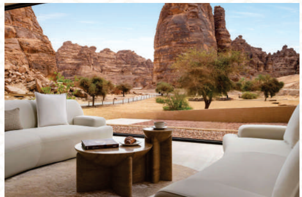
Mid-Range Recommendation Shaden Resort by Accor at AIUla

For specially curated package deals in partnership with the Saudi Tourism Authority, please visit www.brightsun.co.uk/visitsaudi