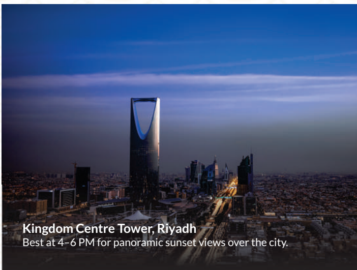
Kingdom Centre Tower, Riyadh

Best at 8–10 AM for peaceful walks through historic mud-brick streets.