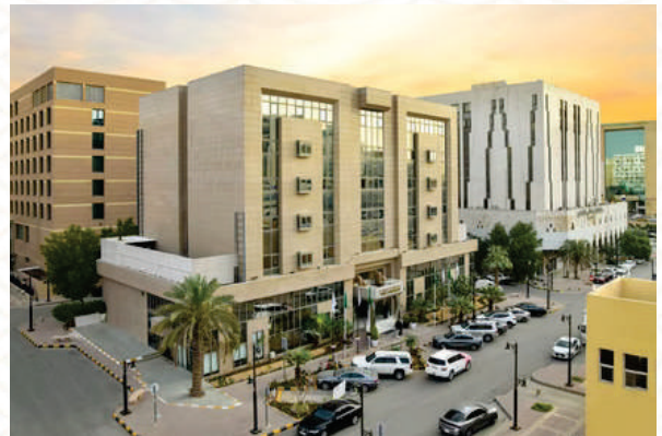
Mid-Range Recommendation Continent Al Waha Hotel, Riyadh