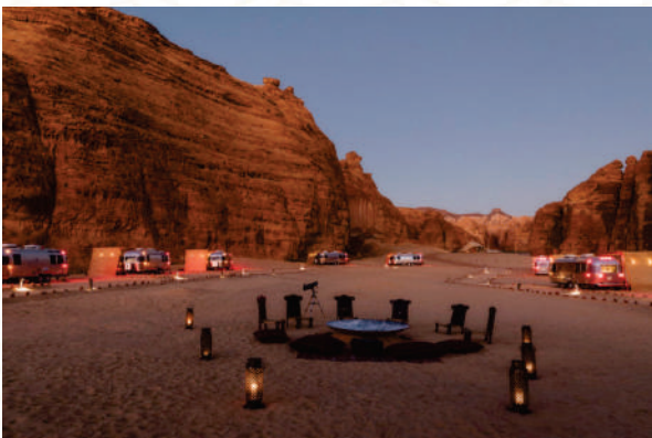
Luxury Recommendation Caravan AIUla by Our Habitas