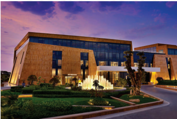
Luxury Recommendation The St. Regis Riyadh