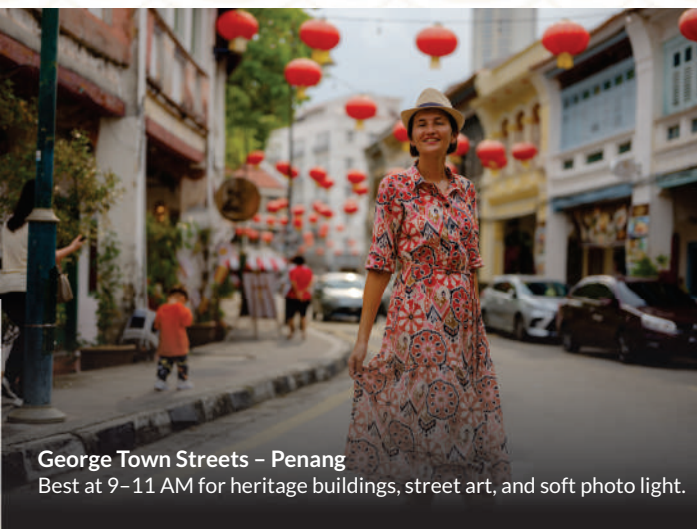
George Town Streets – Penang

Best at 11 AM–2 PM for misty mountain views and clear skies.