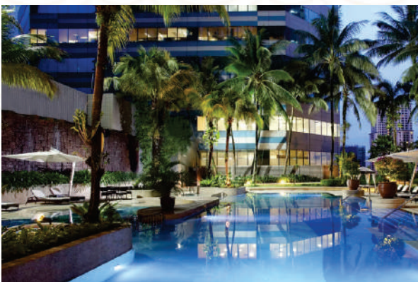
Luxury Recommendation InterContinental, Kuala Lumpur