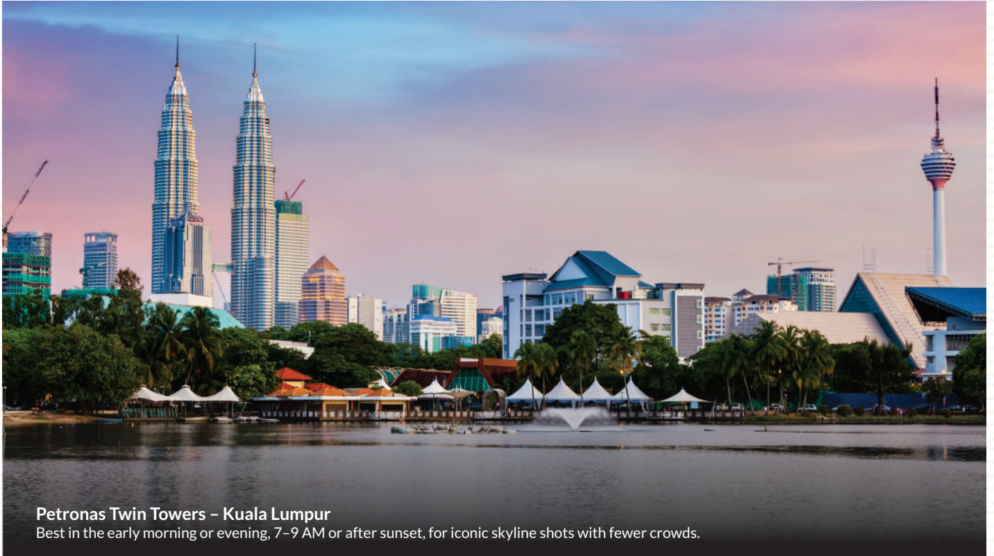
Petronas Twin Towers – Kuala Lumpur

Best in the early morning or evening, 7–9 AM or after sunset, for iconic skyline shots with fewer crowds.