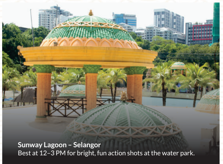
Sunway Lagoon – Selangor

Best at 9–11 AM for heritage buildings, street art, and soft photo light.