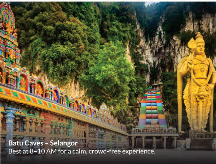
Batu Caves – Selangor

Best in the early morning or evening, 7–9 AM or after sunset, for iconic skyline shots with fewer crowds.