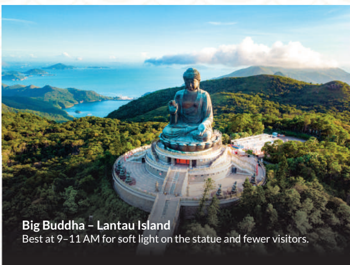
Big Buddha – Lantau Island

Best at 7–10 PM for illuminated skyline shots and night photography.