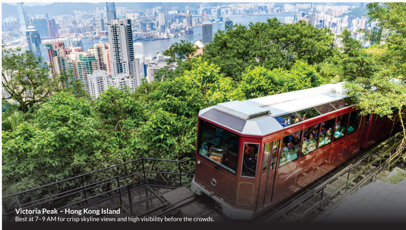
Victoria Peak – Hong Kong Island

Best at 7–9 AM for crisp skyline views and high visibility before the crowds.