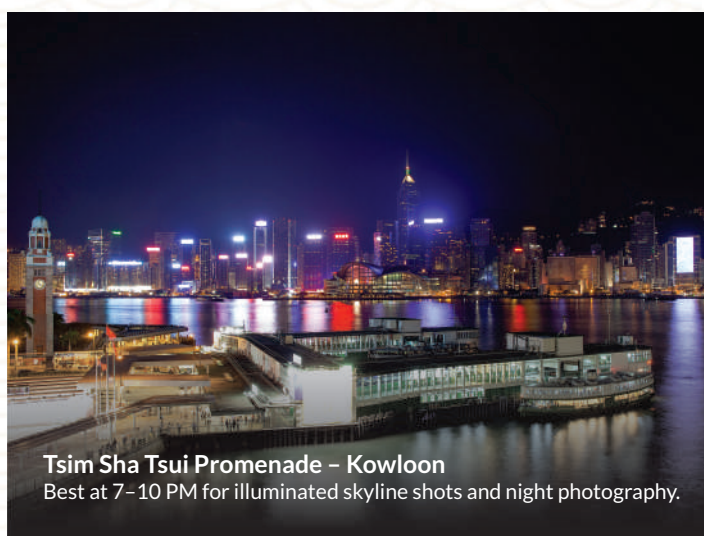
Tsim Sha Tsui Promenade – Kowloon

Best at 5:30–7 PM for golden-hour reflections on the water.