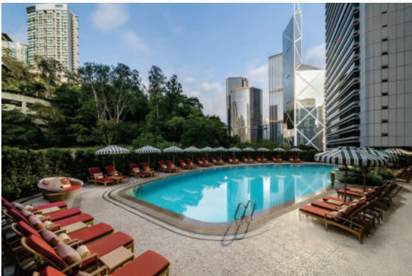
Luxury Recommendation Island Shangri-La, Hong Kong