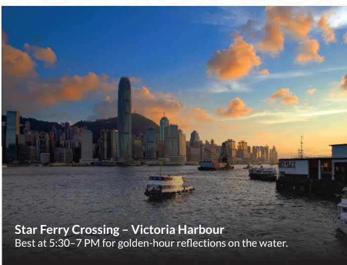
Star Ferry Crossing – Victoria Harbour

Best at 7–9 AM for crisp skyline views and high visibility before the crowds.