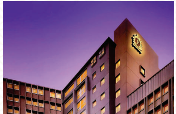
Mid-Range Recommendation Park Hotel, Hong Kong

For specially curated package deals in partnership with the Hong Kong Tourism Board, please visit www.brightsun.co.uk/hongkong