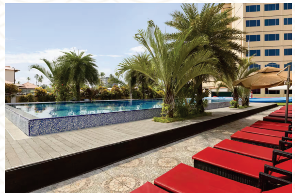
Mid-Range Recommendation Ramada by Wyndham Alleppey/Houseboat