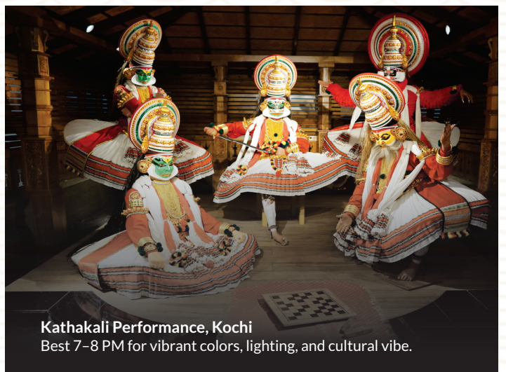
Kathakali Performance, Kochi

Best at 5–6 PM for golden-hour light and dramatic coastal silhouettes.