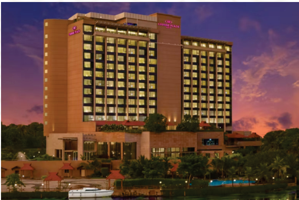
Luxury Recommendation Crowne Plaza Kochi