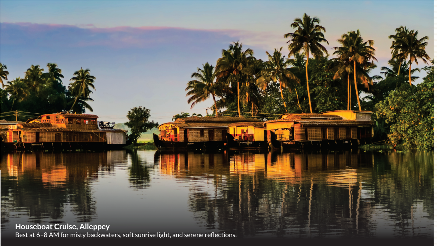
Houseboat Cruise, Alleppey

Best at 6–8 AM for misty backwaters, soft sunrise light, and serene reflections.