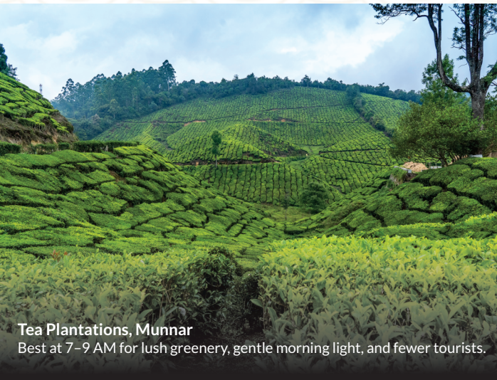
Tea Plantations, Munnar

Best at 6–8 AM for misty backwaters, soft sunrise light, and serene reflections.