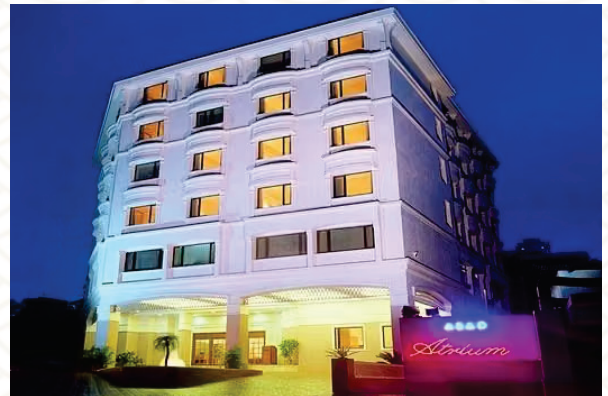
Mid-Range Recommendation Abad Atrium Hotel, Kochi