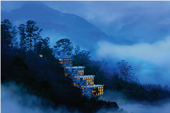
Luxury Recommendation Chandys Windy Woods Munnar