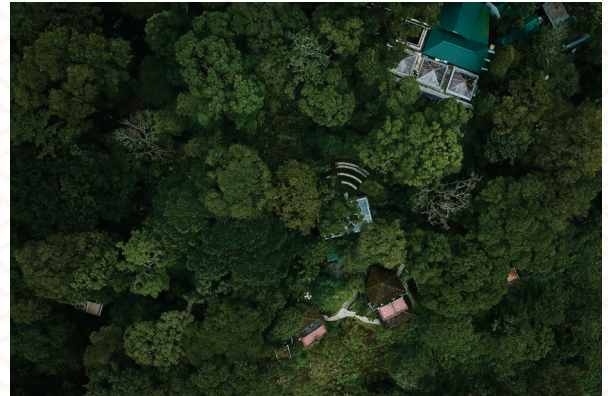
Mid-Range Recommendation The Tall Trees Resorts, Munnar