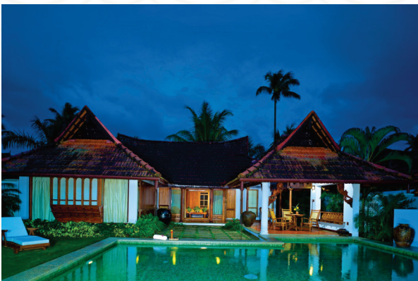
Luxury Recommendation Kumarakom Lake Resort, Alleppey/Houseboat