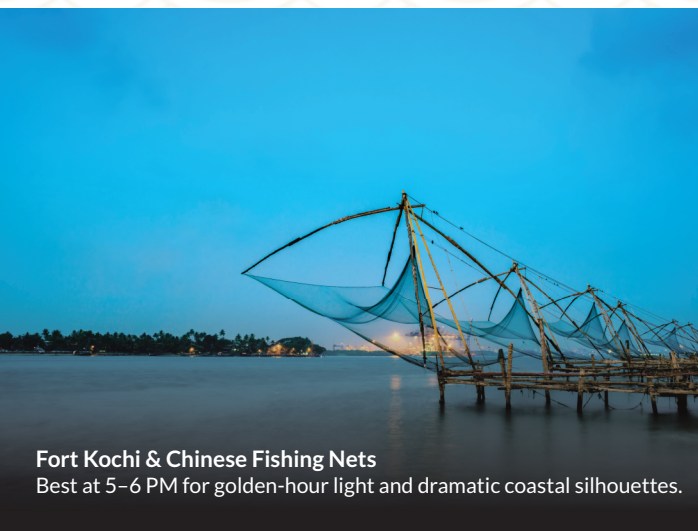
Fort Kochi & Chinese Fishing Nets

Best at 6–8 AM for panoramic views and wildlife spotting.