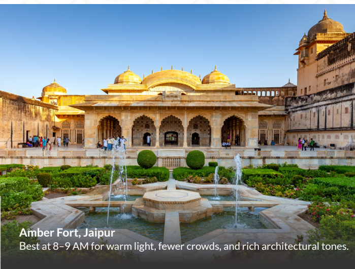
Amber Fort, Jaipur

Best at 6–7 PM for illuminated views and a lively evening vibe.