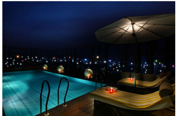
Mid-Range Recommendation Park Plaza, Delhi