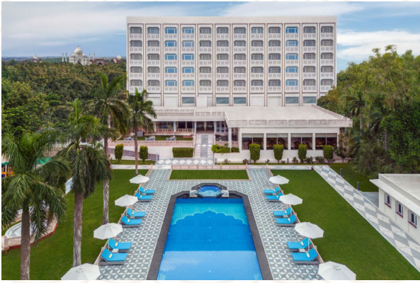
Luxury Recommendation Tajview Agra – IHCL SeleQtions