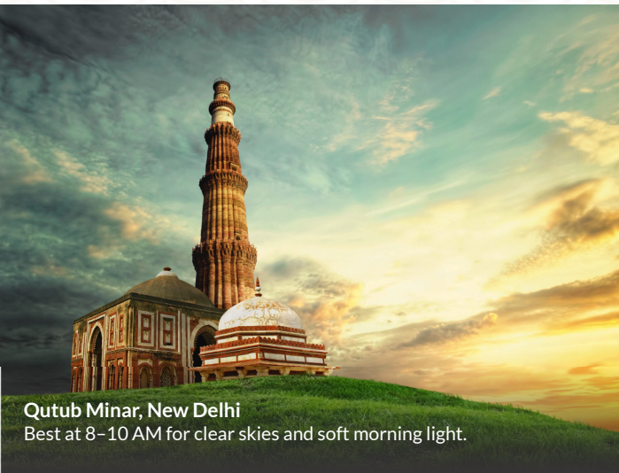
Qutub Minar, New Delhi

Best at 6–7:30 AM for soft sunrise light, fewer crowds, and glowing marble reflections.