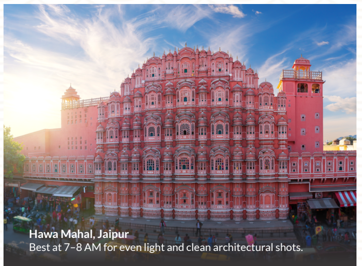
Hawa Mahal, Jaipur

Best at 8–9 AM for warm light, fewer crowds, and rich architectural tones.