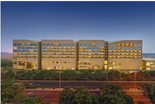
Luxury Recommendation Vivanta Dwarka, Delhi