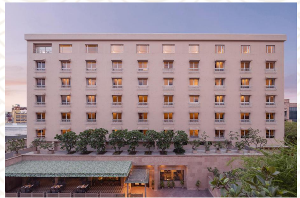
Mid-Range Recommendation Sarovar Portico Jaipur