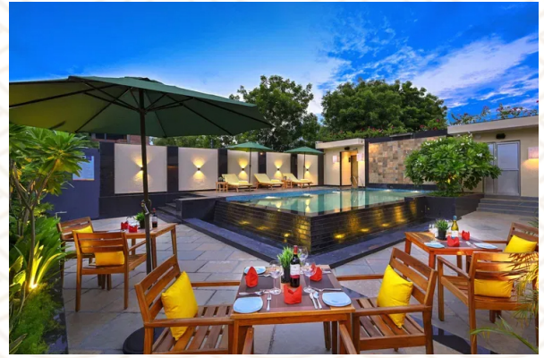
Mid-Range Recommendation Royale Sarovar Portico, Agra