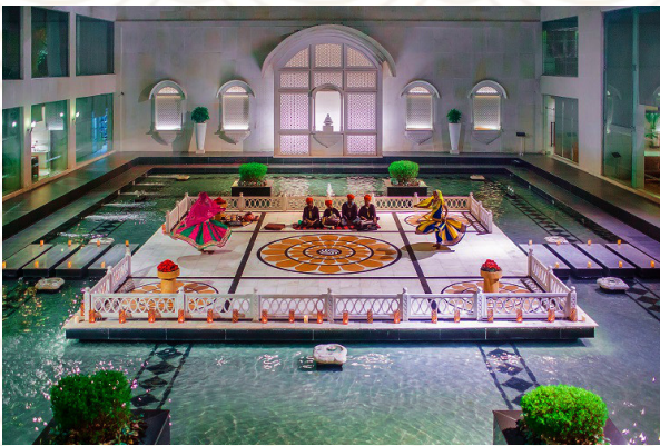
Luxury Recommendation The Lalit Jaipur