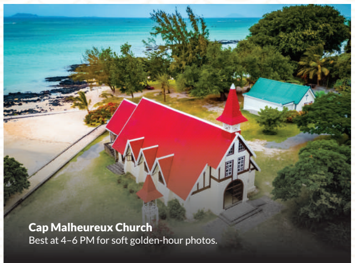
Cap Malheureux Church

Best at 10 AM–12 PM for bright turquoise water.