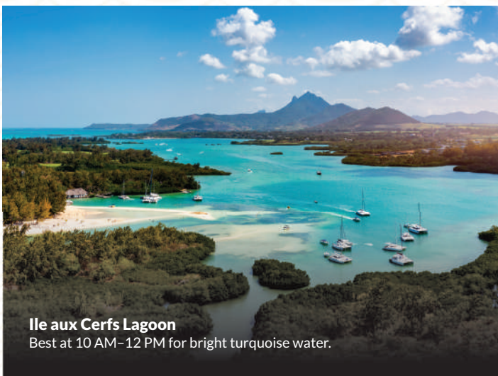
Ile aux Cerfs Lagoon

Best at 10–11 AM when sunlight brightens the falls.