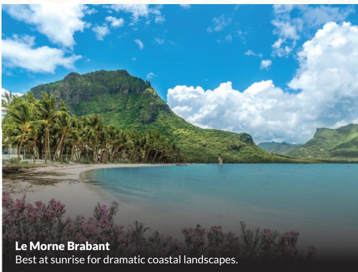
Le Morne Brabant

Best at 9–11 AM for vibrant colours and clear views.