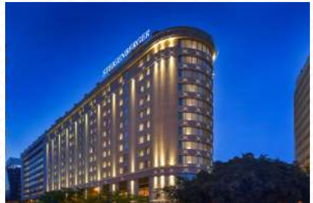
Mid-Range Recommendation Steigenberger Tahrir Hotel