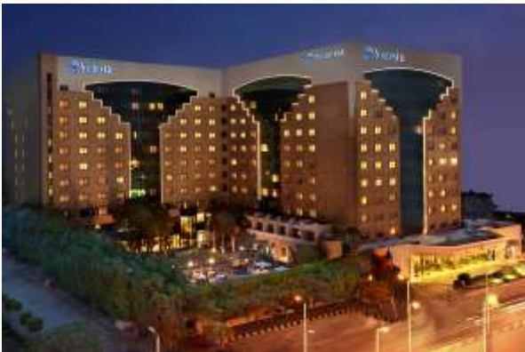
Luxury Recommendation Sonesta Hotel Tower & Casino