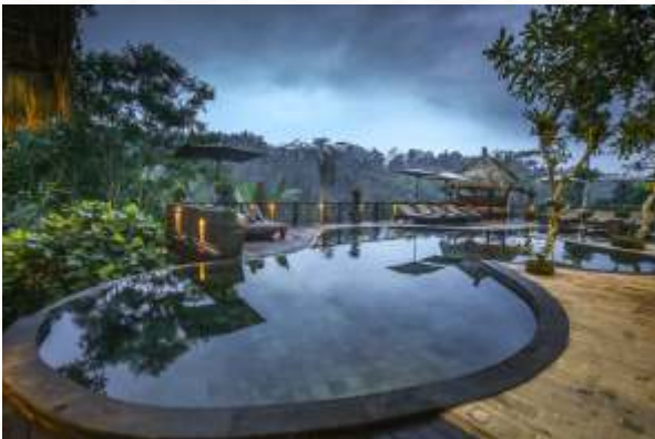
Luxury Recommendation Nandini Jungle Resort and Spa Bali