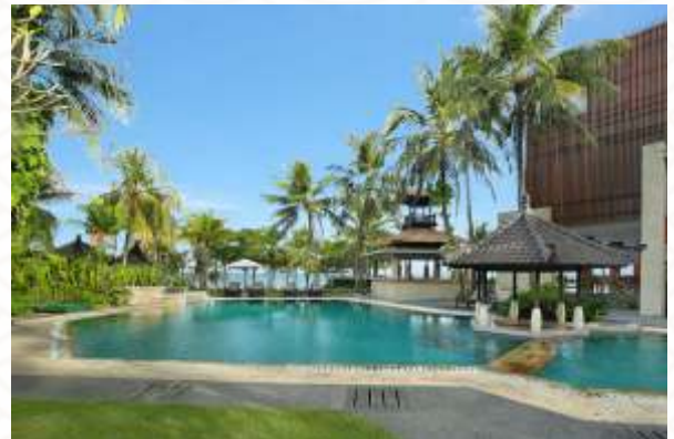
Mid-Range Recommendation Candi Beach Resort & Spa Bali