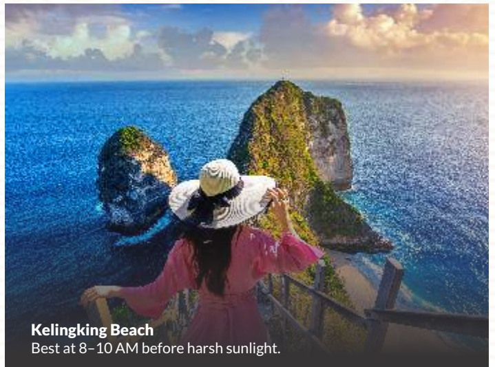
Kelingking Beach Best at 8–10 AM before harsh sunlight.