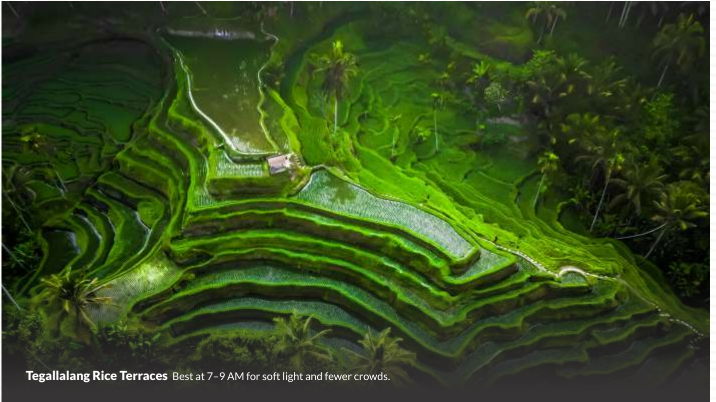
Tegallalang Rice Terraces Best at 7–9 AM for soft light and fewer crowds.