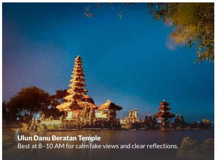
Ulun Danu Beratan Temple Best at 8–10 AM for calm lake views and clear reflections.