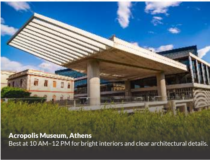
Acropolis Museum, Athens Best at 10 AM–12 PM for bright interiors and clear architectural details.