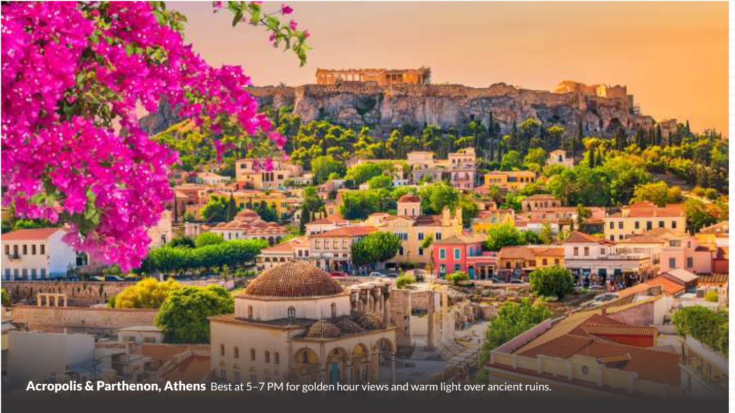
Acropolis & Parthenon, Athens Best at 5–7 PM for golden hour views and warm light over ancient ruins.