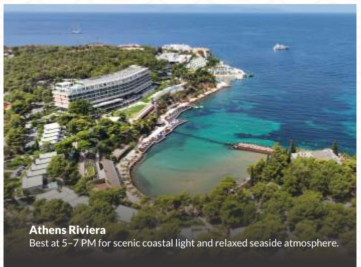
Athens Riviera Best at 5–7 PM for scenic coastal light and relaxed seaside atmosphere.