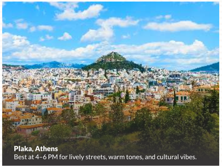
Plaka, Athens Best at 4–6 PM for lively streets, warm tones, and cultural vibes.