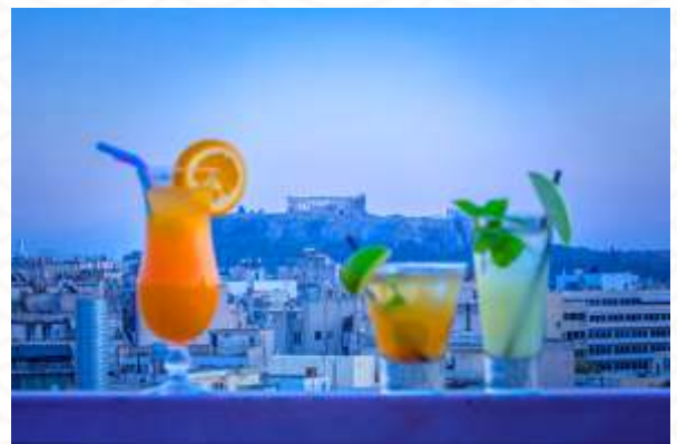
Mid-Range Recommendation Novus City Hotel