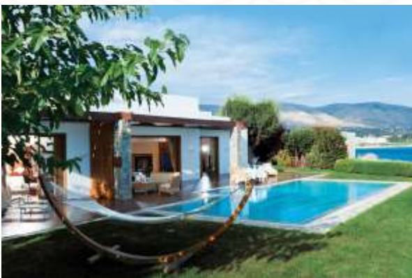
Luxury Recommendation Grand Resort Lagonissi Athens